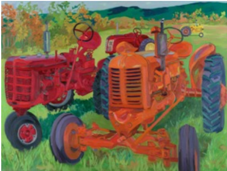
Autumn 36h x 48w inches Oil on canvas