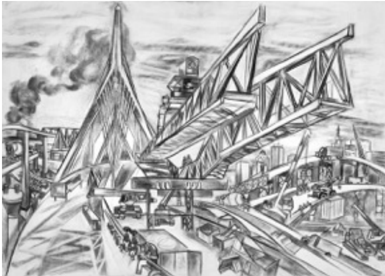
Dismantling Gantry Crane, Boston, by Marne Rizika 30h x 40w inches, Charcoal on Paper