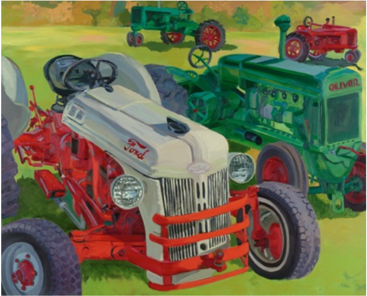
Harvest 34h x 42w inches Oil on canvas